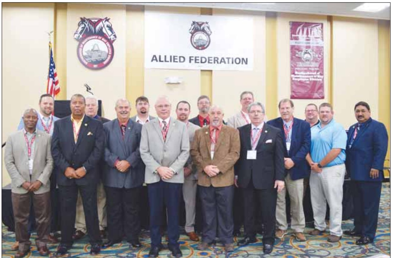
All 16 full-time Allied Federation System Officers were re-elected by acclimation at the Quadrennial Convention held in Tampa, Florida, October, 2016.

on strike. Also included was a resolution honoring fallen BMWED members who were killed as a result of hazardous working conditions. Our fallen Brothers were also memorialized by plaques set up in the convention hall, allowing attendees to pay their respects.